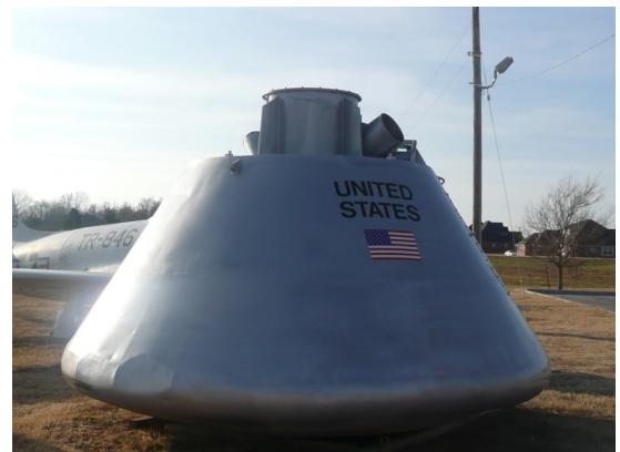
Above: Boilerplate in its current position.

This artifact is on loan from the Smithsonian National Air and Space Museum in Washington, D.C.