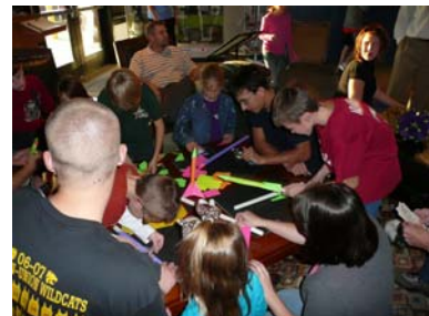
Kids Building rockets to launch