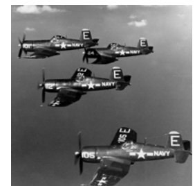
Pictured above: F4u Corsairs

Keep an eye on the museum website for more information on exact dates.